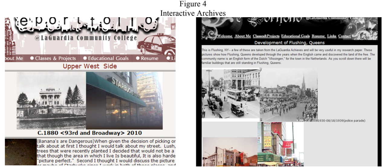
Figure 4: Students juxtapose modern day snapshots of their New York City neighborhoods with archival photographs, contributing to the archive while fostering its development through digital interactions.

that have proved successful for them. For example, one student assembled a multitude of links to archival videos that informed her understanding of class readings and grouped them on her ePortfolio, granting visitors access to a catalogue of historical background information in support of select literary works. Another student developed a gallery of portraits of Latino authors, formulating a "hall-of-fame" and interactive "click-and-name" game for neglected American poets, playwrights, novelists, and short story writers foregrounding faces that may not be as recognizable as their canonized counterparts. Several students have also posed visual-textual inquiries, juxtaposed in an active, multimedia field enabled for digital exchange, as a strategy for gathering evidence. In Figure 3, a student enrolled in a writing, sociology, and urban studies learning community poses a research question about the preservation of Chinese culture in Manhattan's Chinatown. The student incorporated audience responses from both inside and outside of the learning community into her own reflections as she moved forward to craft a thesis and outline for her research paper.