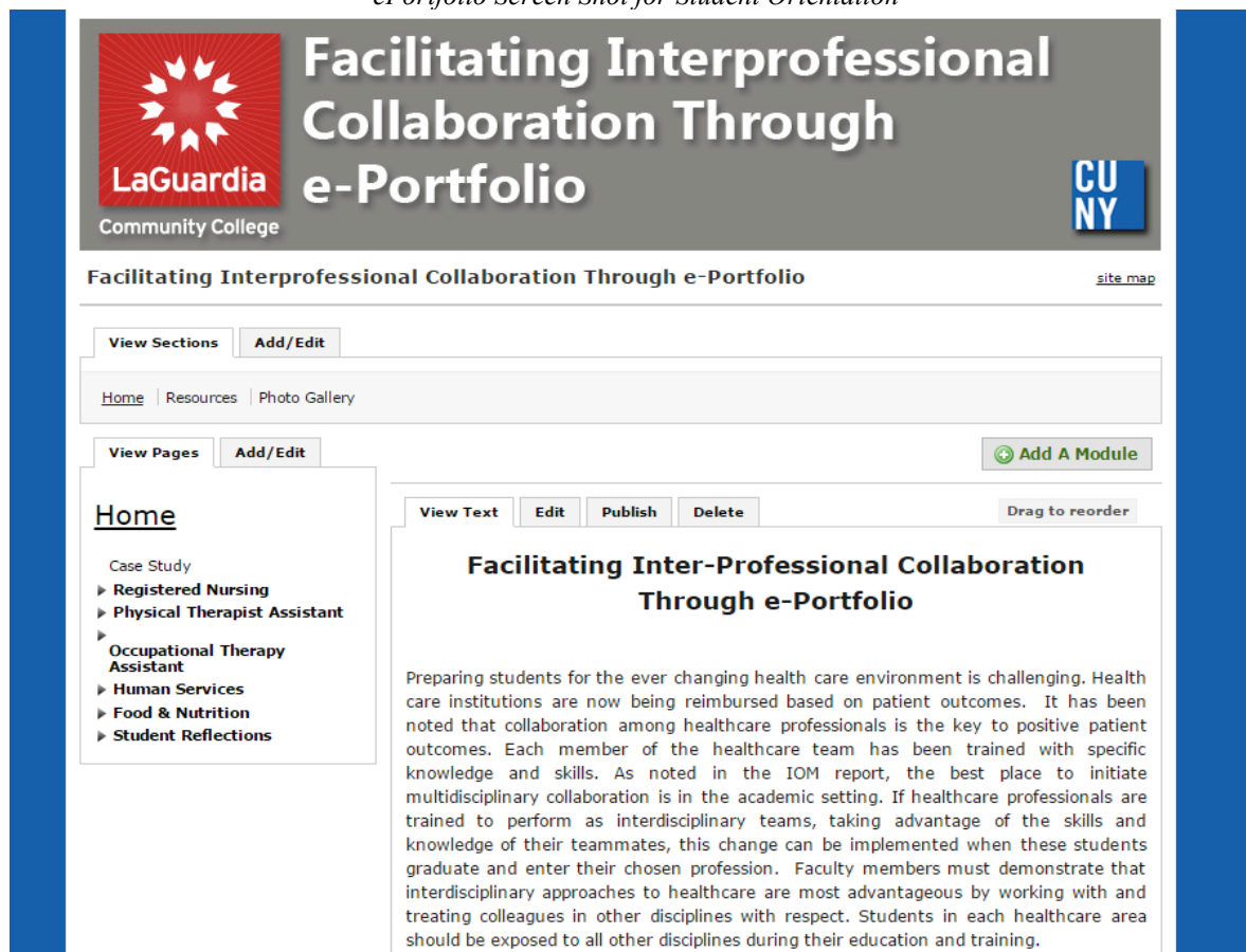
Figure 1 ePortfolio Screen Shot for Student Orientation

collaborating with the occupational therapist (OT) in the process of the evaluation and treatment of clients in the clinical setting. The scope or practice of an OTA is directed by a treatment plan developed by a licensed occupational therapist (New York State Department of Education, 2015a). The OT faculty member provided the evaluation, long and short-term goals, and the plan of care for occupational therapy services. Once the evaluation was entered into the ePortfolio, the faculty and students met to formalize the treatment objectives and plan.